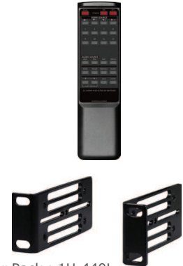
Ear Rack : 1U-440L