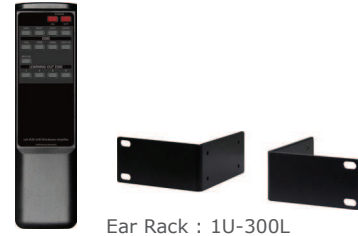
Ear Rack : 1U-300L