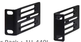
Ear Rack : 1U-440L