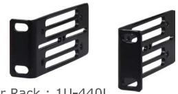
Ear Rack : 1U-440L