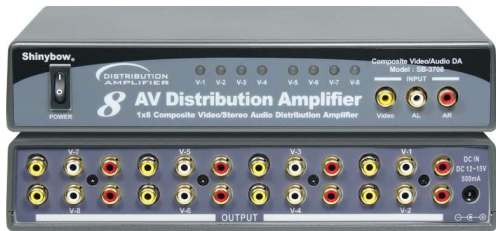
SB-3708 1x8 Distribution Amplifier