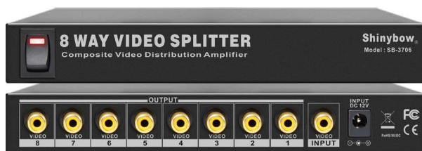
SB-3706 1x8 VIDEO (RCA) Distribution Amplifier