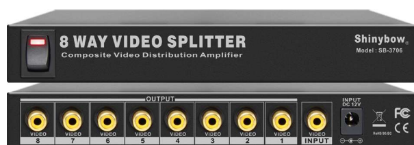
SB-3706 1x8 VIDEO (RCA) Distribution Amplifier