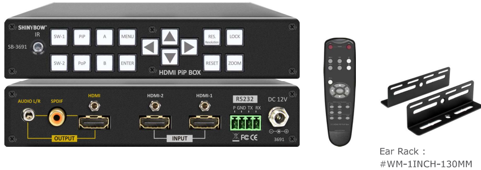
Ear Rack : #WM-1INCH-130MM