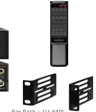
Ear Rack : 1U-440L