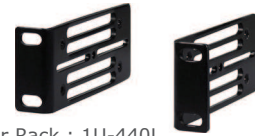
Ear Rack : 1U-440L