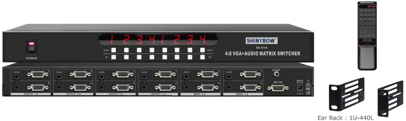
Ear Rack : 1U-440L