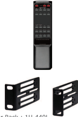
Ear Rack : 1U-440L