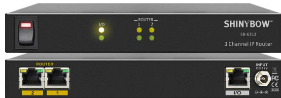
SB-6312 3 Channel IP Router